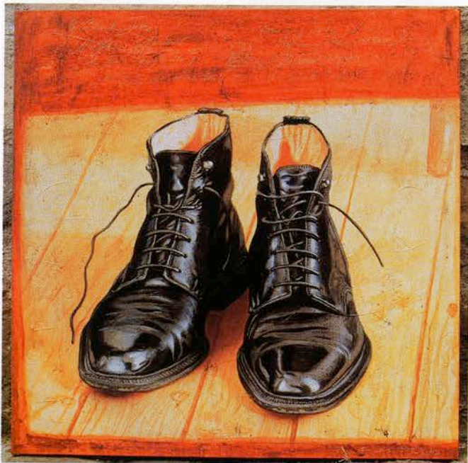
Black Shoes, 1994 (80 cm x 80 cm)

Viewing the collection of Anton Molnar is to be taken on many extensive voyages. Be it still life works of subjects depicting the pleasures in life such as an elaborately prepared breakfast on a palace balcony; or portraits of unknown peasants to luminous personalities; or beautiful landscapes, Molnar's