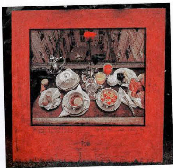
Late Breakfast In The Palace, 1998 (100 cm x 100 cm)